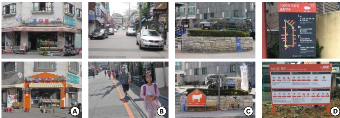
Fig. 3. Seoul Dementia Healing Design Project-Environmental Design facilities. (A) Pre- and post-installation of helpful service facilities named Gil Ban Jang (top: before; bottom: after). (B) Pre- and post-intervention in Cognitive Health Walking Course with 100-m trail marks on the road (left: before; right: after). (C) Pre- and post-intervention in one of the 7 rest areas (left: before; right: after). (D) 100-m trail bulletin board and exercise picture board along the Cognitive Health Walking Course.